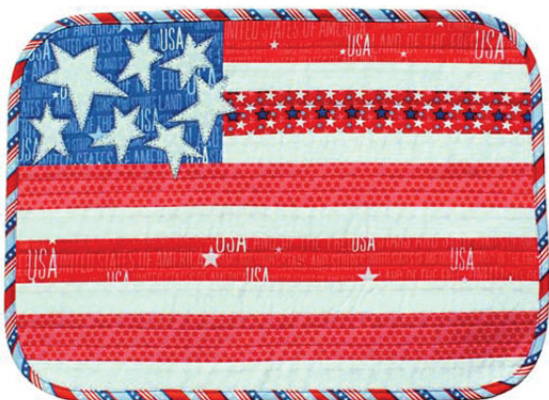
13" x 18"